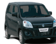
Super Pearl Black