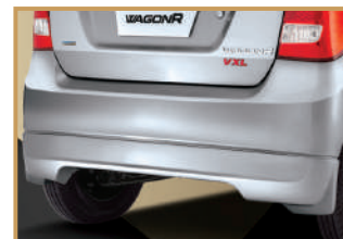
Rear Under Spoiler